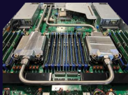
2 Socket CPU server showing Vaporators and metal internal tubing